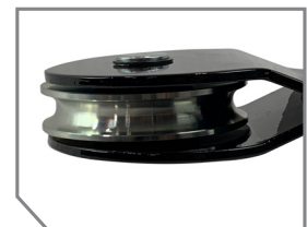
STANDARD 16K HAS A BLACK GLOSS FINISH