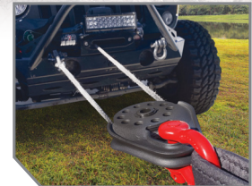
WORKS WITH OTHER RECOVERY GEAR

The Overland Vehicle Systems Snatch Block - Heavy Duty is a heavy duty offroad recovery accessory that allows you to easily drag your truck, tractor, ATV, or UTV out of snow or other difficult situations. The two rings rotate for angled pulls and the anti-corrosion coatings make it a reliable offroad accessory. There is also 16,000 LB. Standard option for lower extremity recovery situations. Whether you're stuck in the mud or snow, the Overland Vehicle Systems Heavy Duty Snatch Block will help you get your vehicle out without any hassle. Order yours today and be prepared for any offroad adventure!