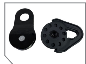
STANDARD 16K AND HEAVY-DUTY 20K OPTIONS